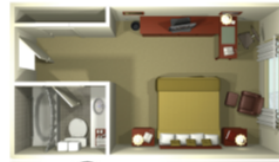
Resident or Patient Rooms