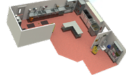
Back of the House